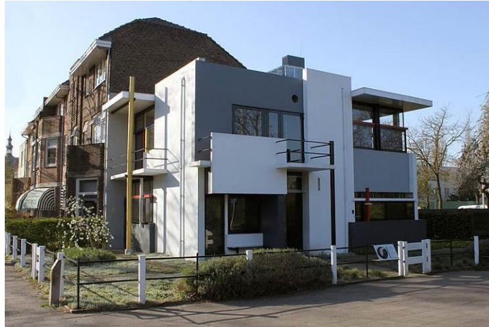
Schröder house, Utrecht, 1924 6

own families and to truth in their emotional lives. Bourgeois notions of respectability and propriety, with their emphasis on discipline, hierarchy, and containment would be eliminated through architectural design that countered each of these aspects in a conscious and systematic way. 5