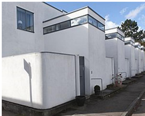
Terrace homes by J J P Oud, 1927 9