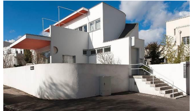
The Scharoun residence 12