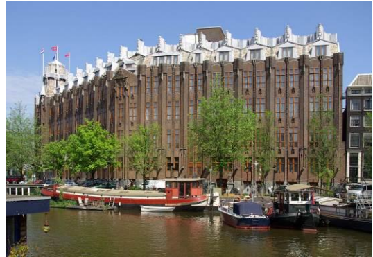
The Scheepvaarthuis, Amsterdam 14