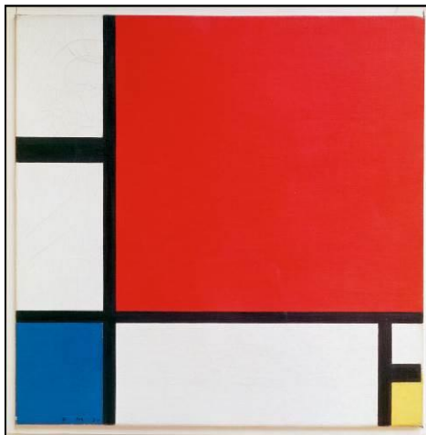
Composition with Yellow, Blue & Red, 1930, Kunsthaus Zürich 1

Pieter Cornelis (Piet) Mondrian was a Dutch painter , An Important contributor to the De Stijl art movement. Despite being well-known, often-parodied, and even trivialized, Mondrian's paintings exhibit a complexity that belies their apparent simplicity. He is best known for his non-representational paintings, which he called compositions , consisting of rectangular forms of red, yellow, blue, or black, separated by thick, black, rectilinear lines. Examples; The composition series,