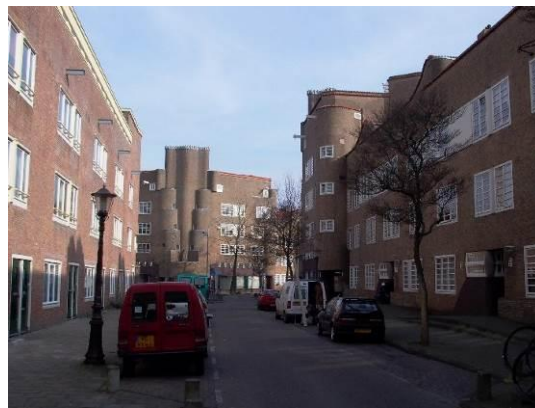
'De Dageraad' housing estate, Amsterdam, 1920-23 (Piet Kramer) 15