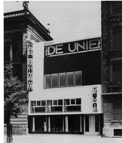
Café De Unie, 1925 8

As of 1932, he was considered one of the four greatest modern architects alongside Ludwig Mies van der Rohe, Walter Gropius and Le Corbusier. He designed the Dutch National War Monument in Amsterdam, the monument on de Grebbeberg and Café De Unie , Rotterdam. (Sharp D, p79) mentions that Oud's façade is highly colored in Mondrainsque primaries which is a two-dimensional composition.