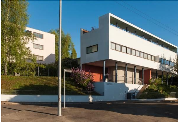
Houses by Le Corbusier & Pierre Jeanneret 11

The twenty-one buildings consist of terraced and detached houses as well as apartment buildings. They vary slightly in form but display standardized design language. What they have in common are their simplified facades, flat roofs used as terraces, window bands, open plan interiors, and the high level of prefabrication which permitted their erection in just five months. Despite popular belief, only about one third of the buildings were completely white. Bruno Taut had his entry, the smallest, painted in various colors. Le Corbusier and Pierre Jeanneret's entry was white, blue, orange, and green. Van der Rohe's was painted a light pink. The eaves of Hans Scharoun's entry were painted orange. 10