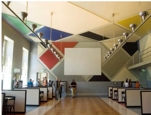
L'Aubette dance cafe in Strasbourg 4

Born as Christian Emil Marie Küpper in Utrecht as the son of a photographer. He was a Dutch artist , who practiced painting, writing, poetry and architecture. He is known as the founder of De Stijl and he was an ' ambassador ' of the movement, promoting it across Europe. He moved to Weimar in 1922, to make an impression on the Bauhaus principal, Walter Gropius and spread the influence of the movement. Doesurg was the driving force behind the group, advocating rejection of traditional art and adoption of a new, abstract language of form involving, for example, the calculated distribution of unequal masses in an anticubist system. In the renovation of the L'Aubette dance café in Strasbourg, France(1926-1928), Doesburg was responsible for the colorful design of the walls and ceilings. He tried to cancel out the boundaries of the spatial structure of the fields that were partially diagonal, partially straight, in the primary colors of blue, red and yellow. When it became apparent that this color was not appealing to the customers, this attempt of meld of art and architecture was judged largely to have failed. 3