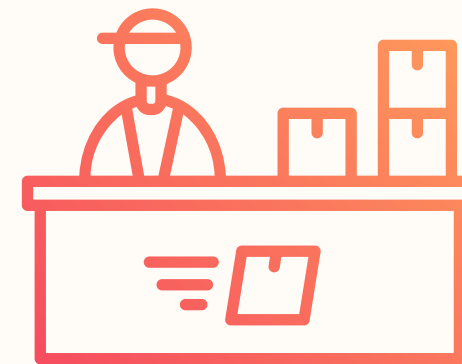
Service Shipment Icon