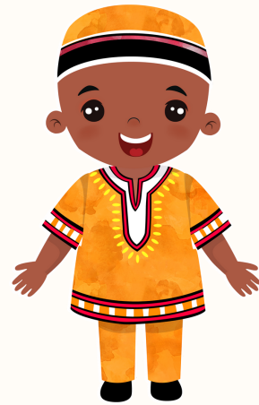
Boy wearing ethnic costume

Bonding: other members in the organization Bridging: other people outside the organization