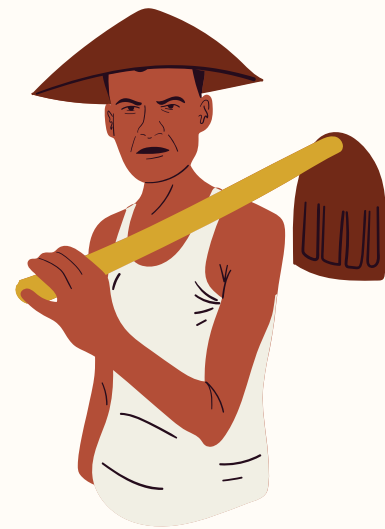
Detailed Farmer with Straw Hat