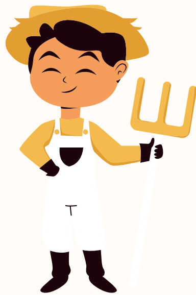
Organic Cartoon Boy as Farmer