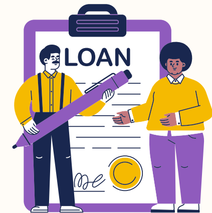
Minimalistic Bubbly Doodle Loan Contract