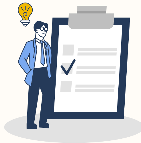
Man Work Office