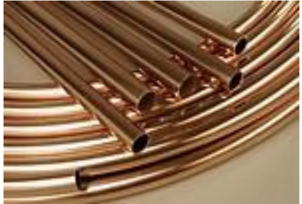
Fig. Copper Pipes

Copper Pipes and tubes are used widely in many industries across the nations. Copper Pipes are economical options with durability being one of the key features. These Pipes contain 99.9% Pure copper in it, with rest being silver and phosphorous. Copper Pipes are used to enable a smooth flow of substance through it. They are used in various machines, equipment, and other industrial appliances.