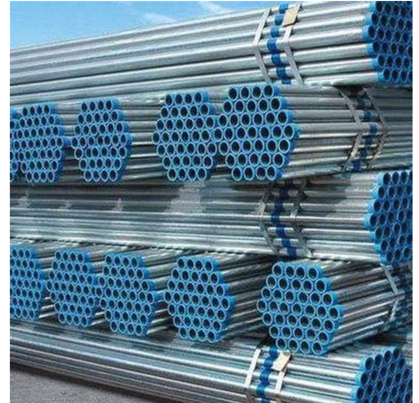
Fig.3: Galvanized Iron (GI) pipes