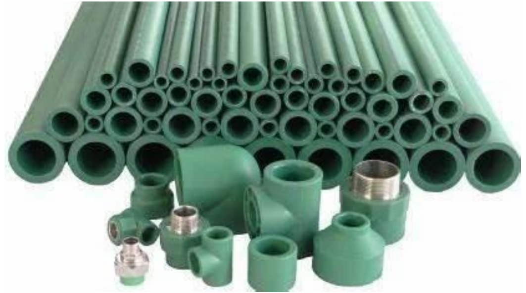
Fig. PPR Pipes

Polypropylene Random Copolymer plastic, produced through a continuous extrusion process. They are commonly offered in green or white color, and in outer diameter sizes ranging from 20mm to 110mm making the pipe walls far thicker than PVC. PPR pipe is accompanied by a series of connection fittings, parts, and accessories available for every pipe diameter.