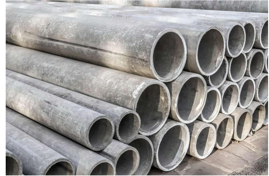
Fig. Asbestos- Cement Pipes

This kind of pipes are made of a mixture of 82-90 % cement and 10-18 % asbestos fibers. They are available in diameters ranging between 60-2000 mm, and can withstand pressure ranging between 6-20 atmospheric pressure. These pipes are connected with separate special fittings. The use of asbestos pipes to convey potable water over the last two decades, due to increasing concern with their health hazards. However, they are still used to convey irrigation and sanitary drainage water.