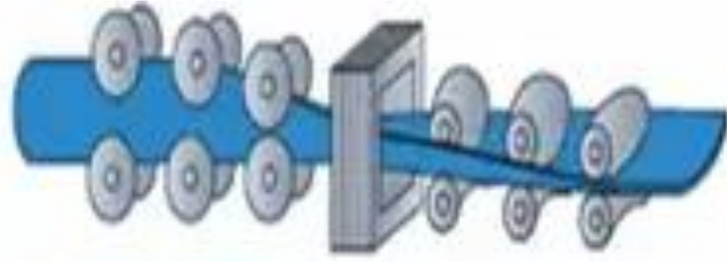
Fig.2: Welded pipe manufacturing

Welded pipes are manufactured from plate or continuous coil or strips to manufacture welded pipe, first plate or coil is rolled in the circular section with the help of plate bending machine or by a roller in the case of continuous process. Once the circular section is rolled from the plate, the pipe can be welded with or without filler material. Welded pipe can be manufactured in large size without any upper restriction. Welded pipe with filler material can be used in the manufacturing of long radius bends and elbow.