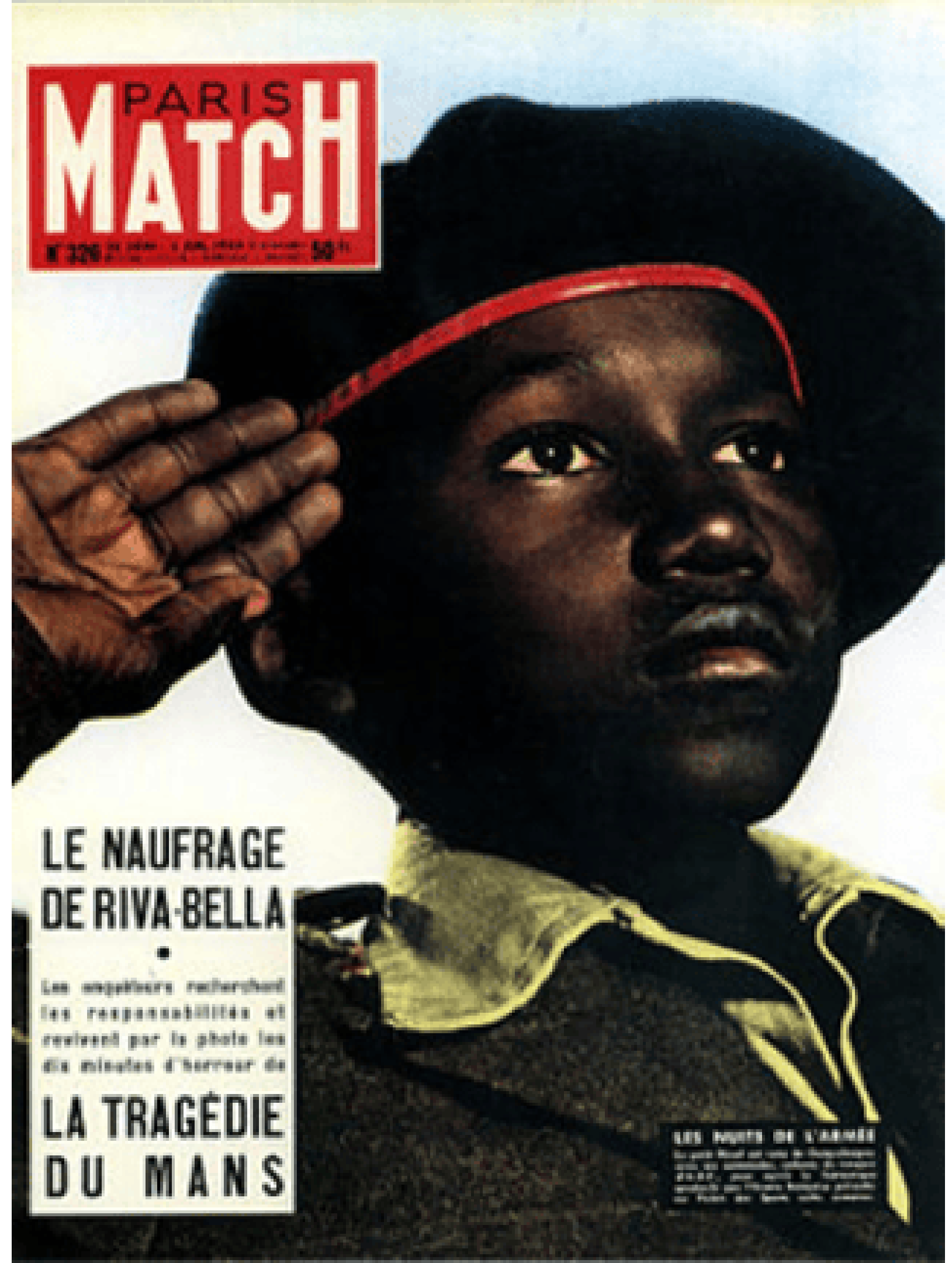
Figure 9 Source: Chandler, 2021: Semiotics the Basics