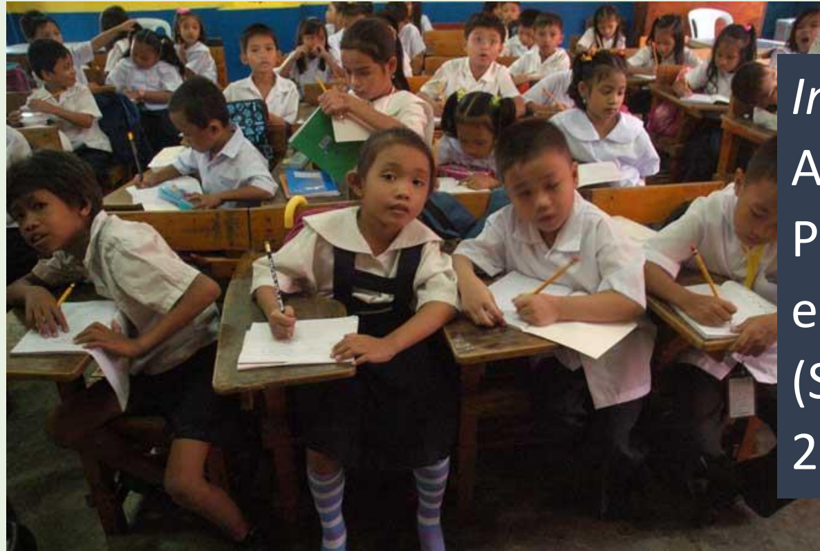
Image 1: Addressing the Philippine education crisis.

Why do we administer various tests to the learners?