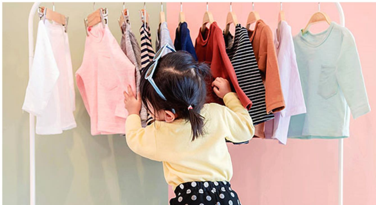
Image 1: Yes, Let Your 3-Year-Old Decide Certain Things on Her Own (and Learn to Live With It!)

How can our tests engage learners to think analytically and critically?