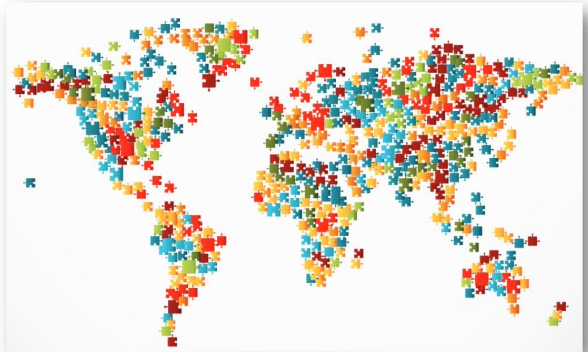
Image 6: Global Citizenship Education: Taking it local

Global citizens are well-versed in the world and how they fit within it. They can be considered a global citizen when they have engaged members of society who collaborate with others to make the world a better, more equitable place.