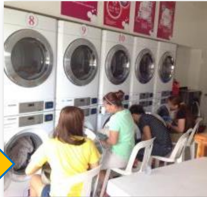
Image 3: Bikers roll out new laundry solution in Batangas