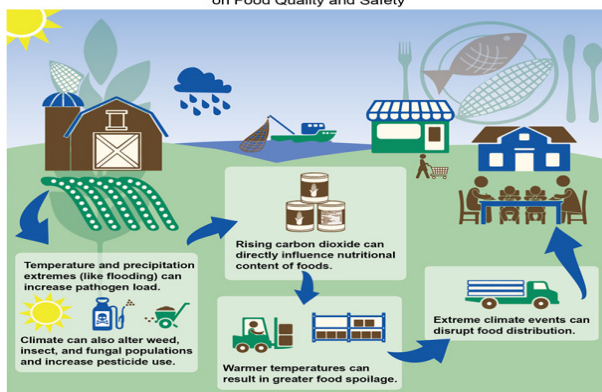
Farm to Table The Potential Interactions of Rising CO 2 and Climate Change on Food Quality and Safety

(Climate Impacts on Human Health, US EPA, Chicago Climate Change.)