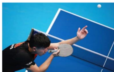
Figure 5: Pingpong Serves: A Complete Guide.

The ball must be tossed at least six (6) inches above the table before it is served.