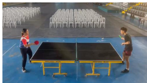
Figure 13: The author owns the video. Demonstrator: Coach Steffy