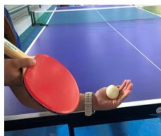
Figure 3 & 4: Demonstrator: Coach Steffy