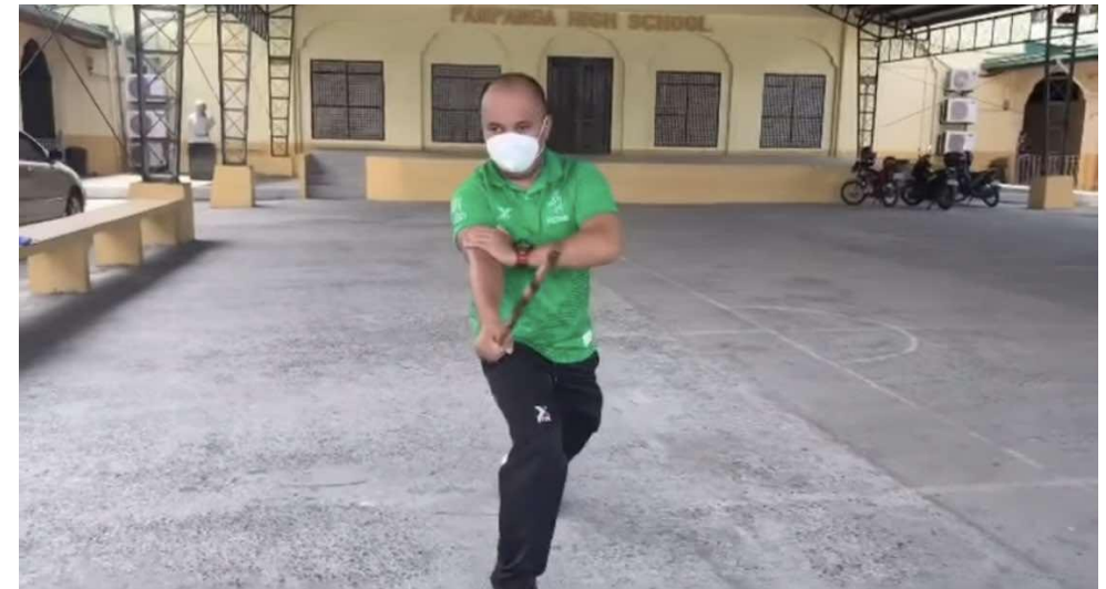
Figure 6: Arnis Basic Skills for Anyo.