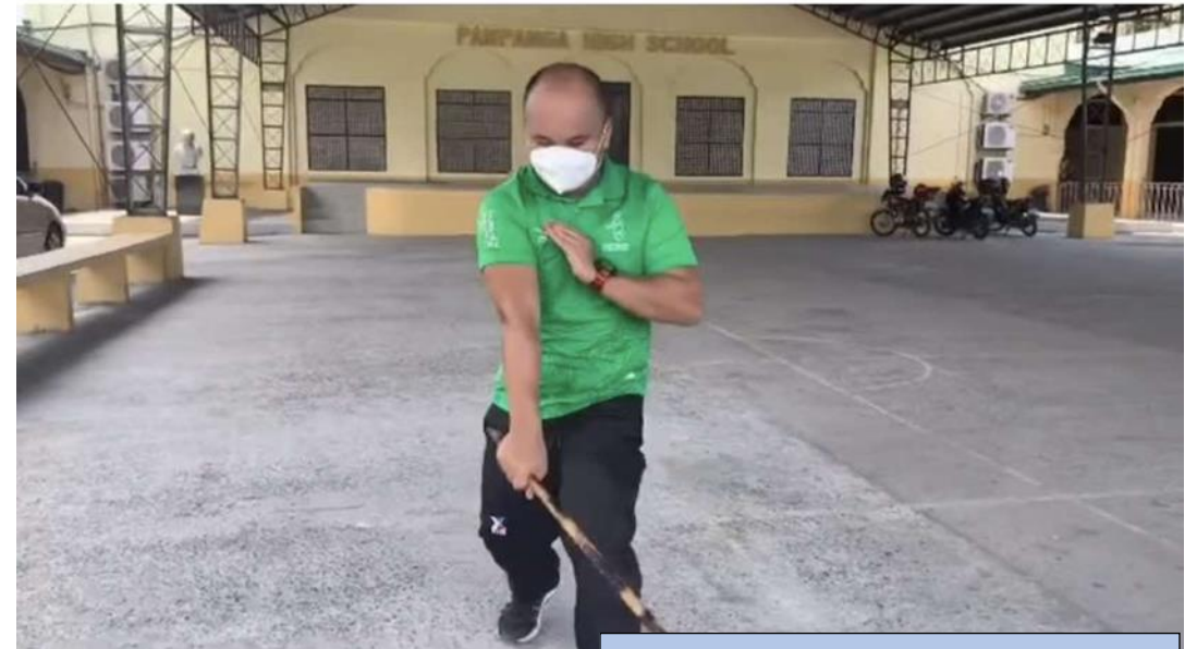
Figure 10: Arnis Basic Skills for Anyo.