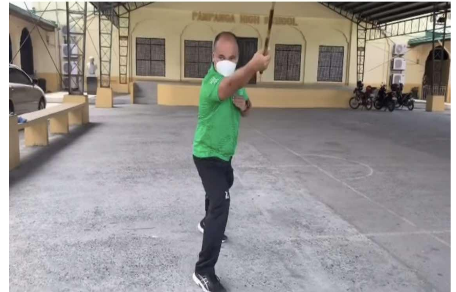
Figure 8: Arnis Basic Skills for Anyo.