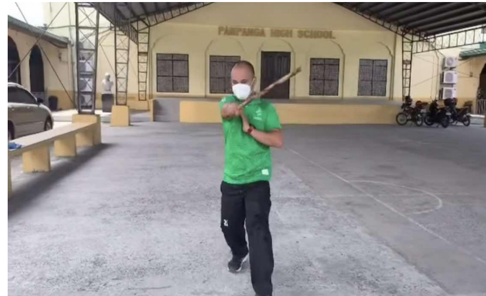
Figure 5: Arnis Basic Skills for Anyo.

- Striking technique towards the left shoulder.