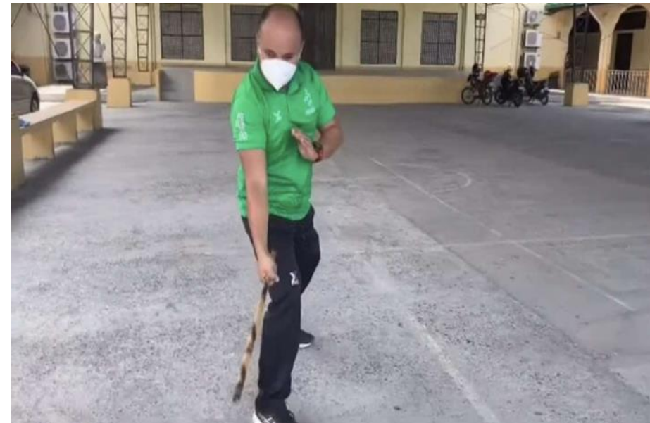
Figure 9: Arnis Basic Skills for Anyo.