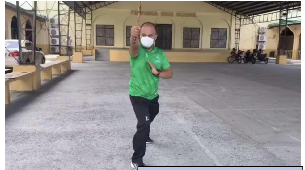
Figure 11: Arnis Basic Skills for Anyo.

- An overhead downward swing of the arms towards the crown or corona part of the head.