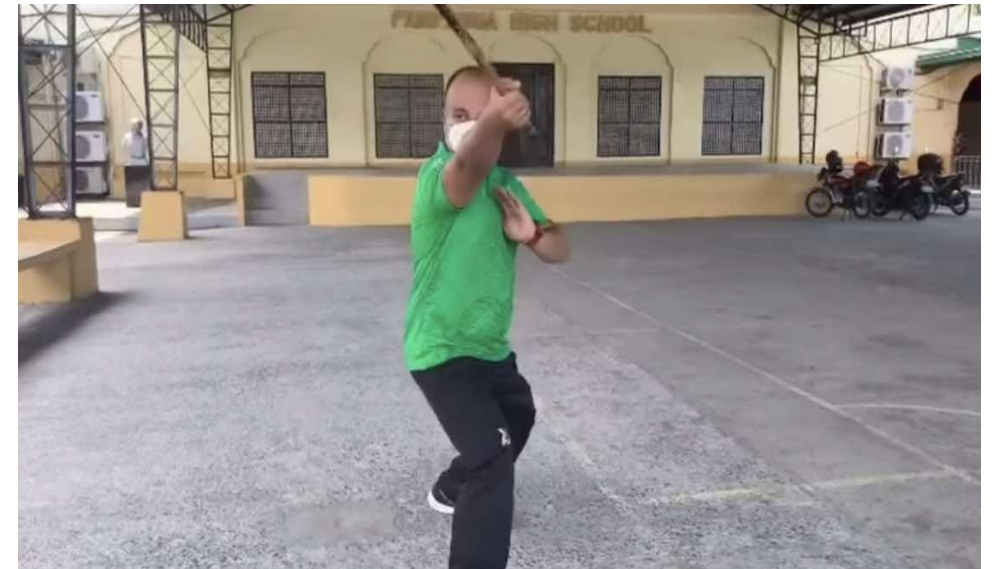
Figure 2: Arnis Basic Skills for Anyo.

- From fighting stance position, execute hitting action diagonally towards the left temple.