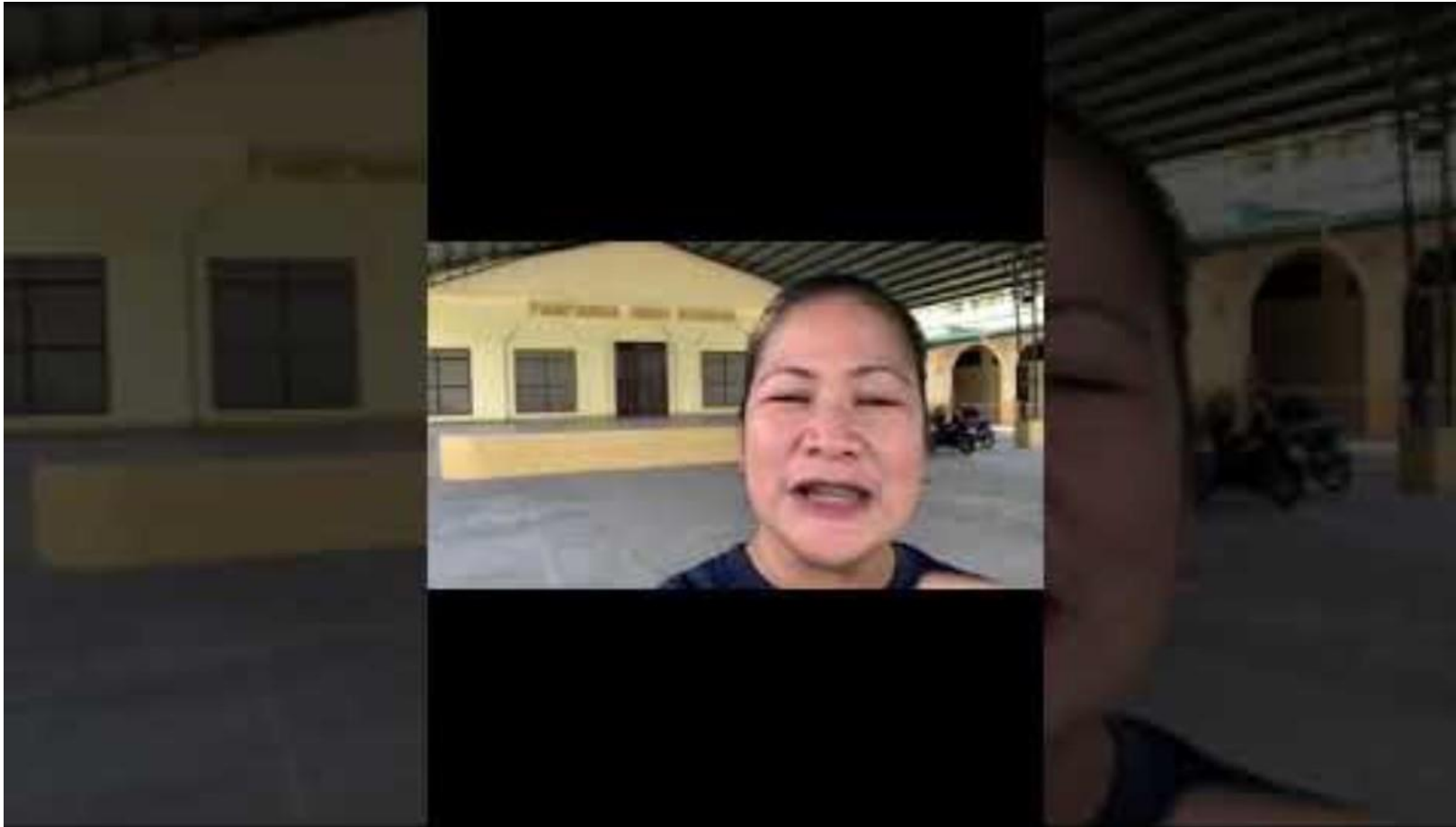
Figure 12: Arnis Basic Skills for Anyo.