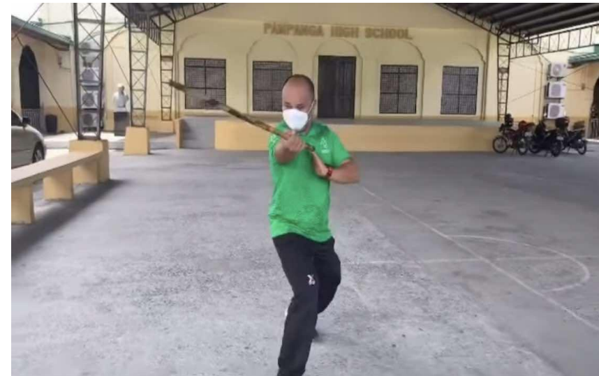
Figure 4: Arnis Basic Skills for Anyo.

- Striking technique towards the left shoulder.