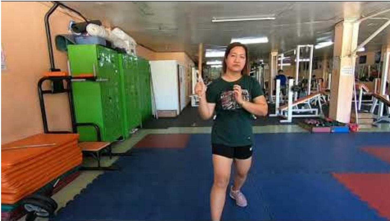
Figure 13: Arnis (Basic Skills).