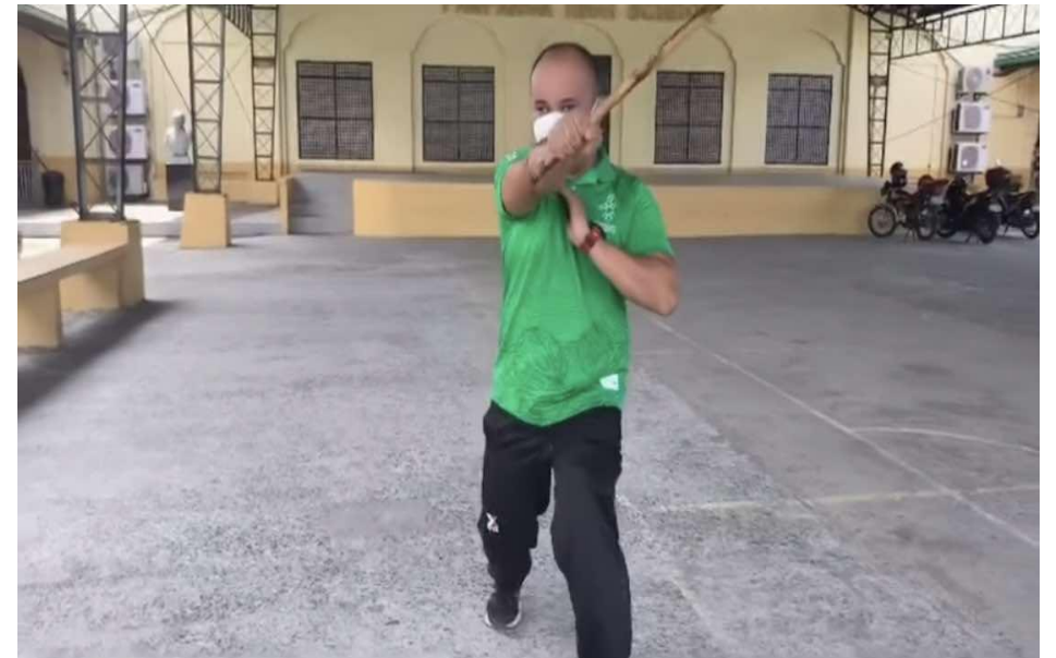
Figure 3: Arnis Basic Skills for Anyo.

- From fighting stance position, execute hitting action diagonally towards the left temple.