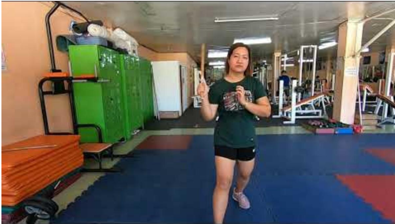
Figure 9: Arnis (Basic Skills)