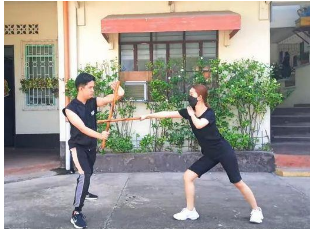
Figure 2: Arnis/ 6 Blocking Techniques / Tutorial