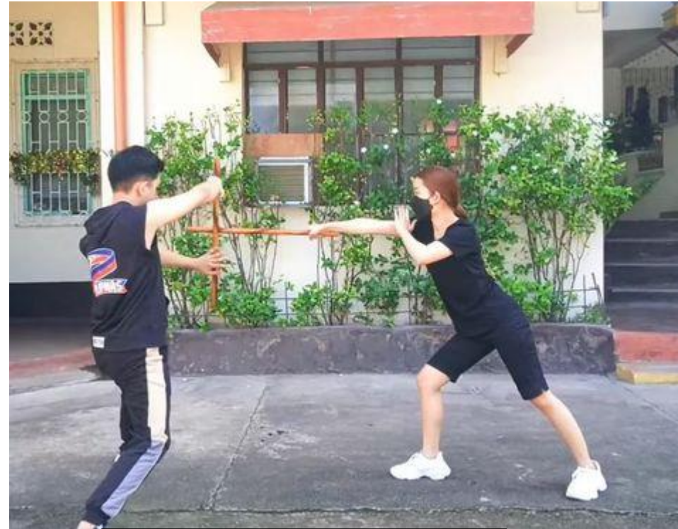
Figure 5: Arnis/ 6 Blocking Techniques / Tutorial