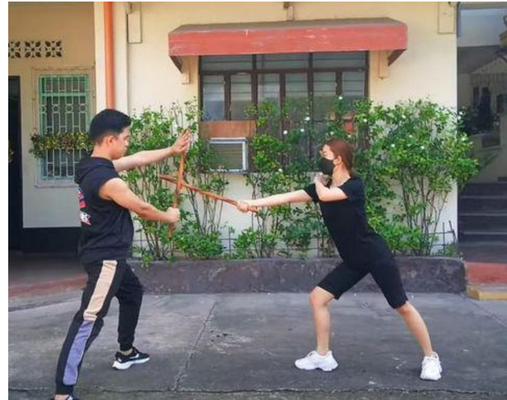
Figure 1: Arnis/ 6 Blocking Techniques / Tutorial