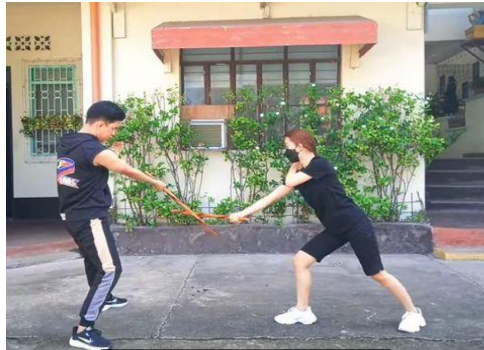
Figure 4: Arnis/ 6 Blocking Techniques / Tutorial