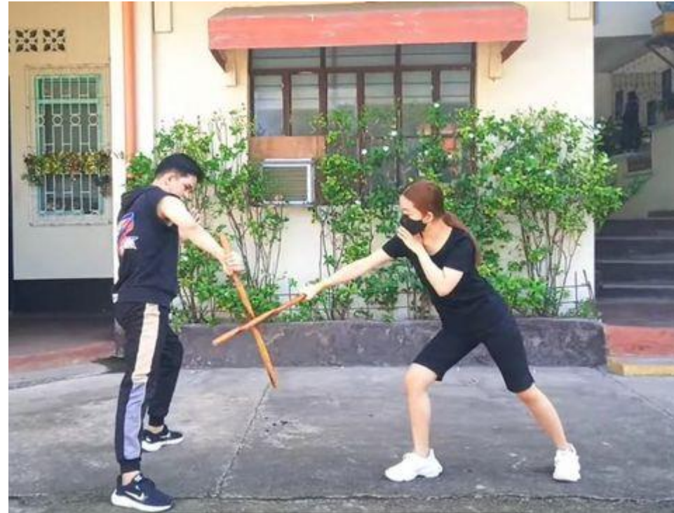
Figure 3: Arnis/ 6 Blocking Techniques / Tutorial