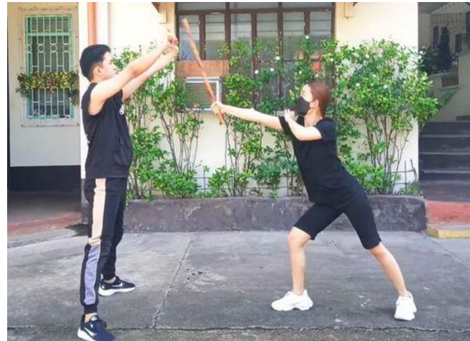
Figure 6: Arnis/ 6 Blocking Techniques / Tutorial